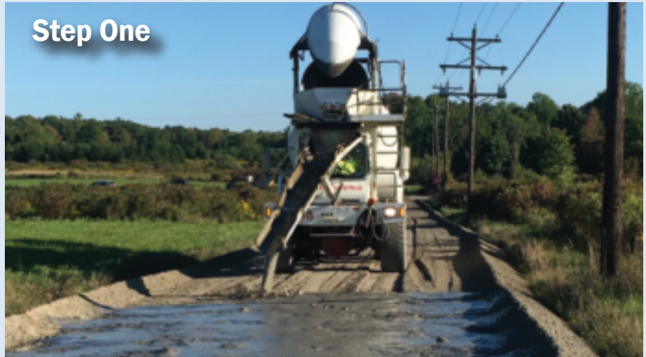
The cement slurry is distributed across a road in Lenox Township, Susquehanna County.

The addition of cement slurry into the existing FDR specification is designed to improve upon and expand the use of FDR, which has been proven to be a cost-effective, long-term improvement for Pennsylvania roads. One advantage of cement slurry, rather than dry cement, is the elimination of the