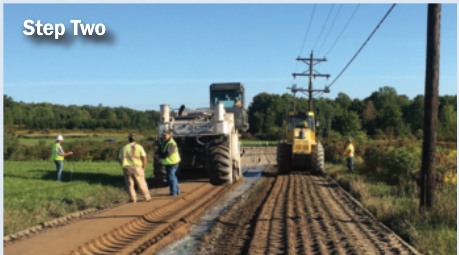
The slurry and pulverized road materials are combined, and the road is prepped for rolling.