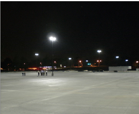
Light Emitting Diode (LED) lighting is now becoming more popular for exterior lighting due to the potential energy savings.

The newest technology in lighting, the Light Emitting Diode (LED) is now making its mark in exterior lighting.